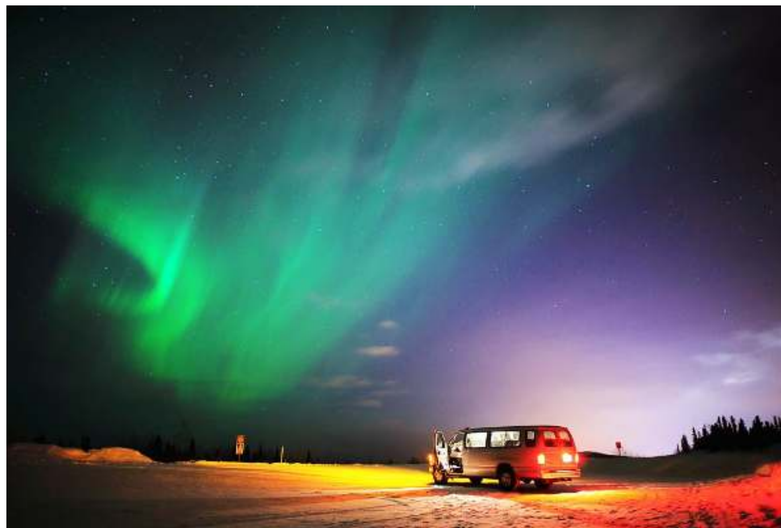
Northern lights, Fairbank