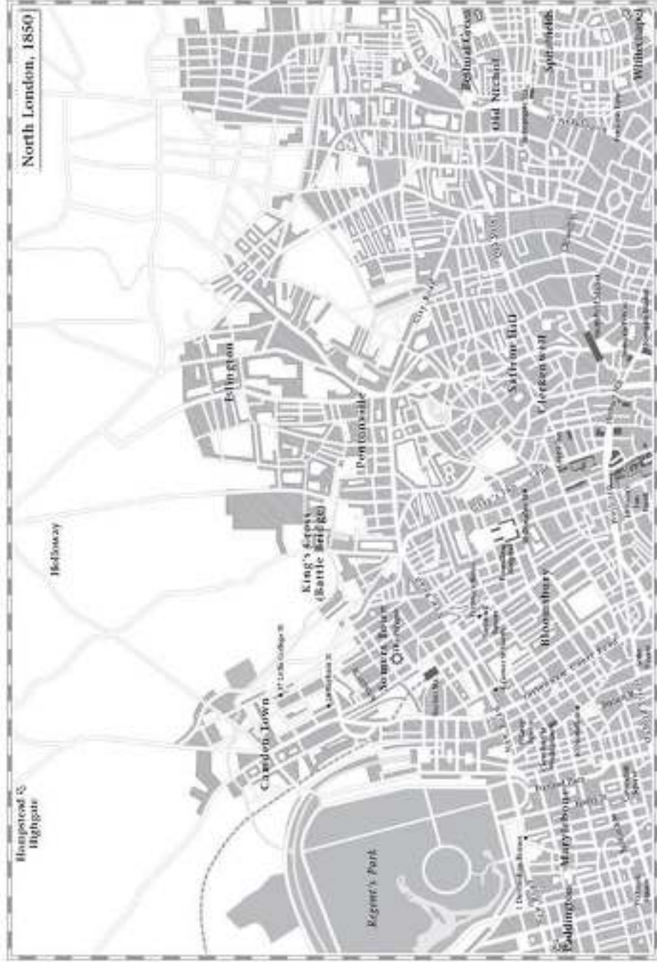
North London, 1850